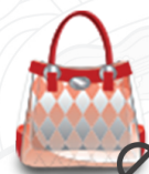
Printed Pattern Plastic Bag