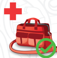
Medically Necessary and Diaper Bags