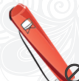
Folding Chair Bag (Folding Chair is Allowed)