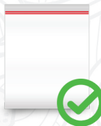
1-Gallon Plastic Freezer Bag