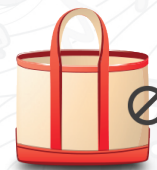
Over-sized Tote Bag