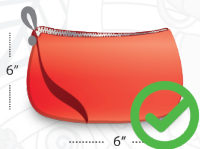
Bags smaller than 6"x 6"x 6"